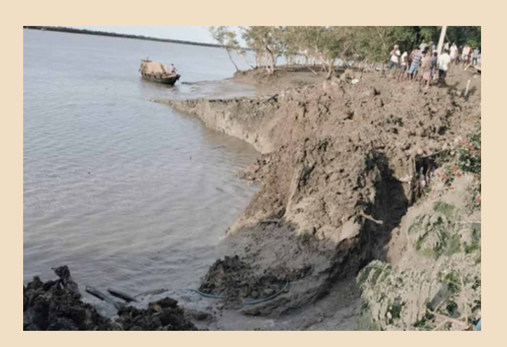
Link to the article: (September 8th, 2024) <a href="https://www.anandabazar.com/west-bengal/24-parganas/residents-of-pakhiralay-village-of-gosaba-in-trouble-after-river-destroyed-dam/cid/1544245">https://www.anandabazar.com/west-bengal/24-parganas/residents-of-pakhiralay-village-of-gosaba-in-trouble-after-river-destroyed-dam/cid/1544245</a>