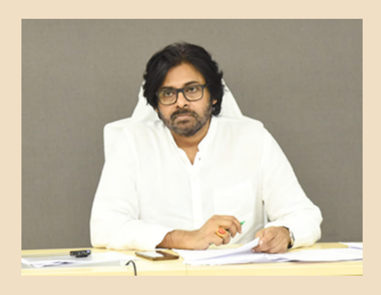
Link to the article: (September 5th, 2024) <a href="https://www.m9.news/politics/andhra-pradesh-govt-begins-purification-of-village-secretariats/">https://www.m9.news/politics/andhra-pradesh-govt-begins-purification-of-village-secretariats/</a>

On September 4, Andhra Pradesh Deputy Chief Minister Pawan Kalyan announced a total donation of Rs 6 crore for flood relief in the affected Telugu states. This includes Rs 1 crore each for the Andhra Pradesh and Telangana Chief Ministers' Relief Funds and Rs 4 crore allocated for 400 villages in Andhra Pradesh, providing Rs 1 lakh to each panchayat. Kalyan emphasised his commitment to help flood victims and criticised opposition leaders for their comments on relief efforts. He also highlighted ongoing sanitation measures and the government's swift response to support affected a focused communities, including 100-day sanitation drive.