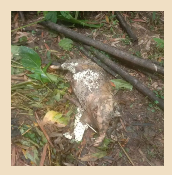
Link to the article: (September 3rd, 2024) https://www.deccanchronicle.com/nation/currentaffairs/odisha-9-year-old-found-dead-local-boydetained-1820250

A Heavily decayed carcasses, believed to be wild boars, were discovered on the De Lui bank in Tlabung, Mizoram, raising concerns about a potential African Swine Fever outbreak on Friday. Authorities found bones, and bear footprints, likely from scavengers who consumed the remains. Initial reports suggested 17 carcasses, but the inspection revealed 25. The Animal Husbandry and Veterinary Department is in the process of disinfecting the area to prevent further complications as African Swine Fever continues to spread in these areas. No official reason and record for the death of the boars has been released.