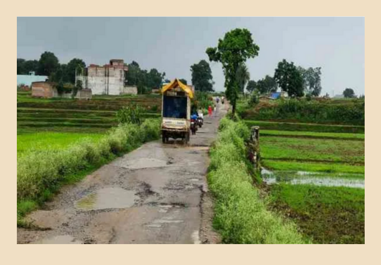
Link to the article: (September 8th, 2024) <a href="https://lagatar.in/roads-in-rural-areas-are-dilapidated-people-are-worried/">https://lagatar.in/roads-in-rural-areas-are-dilapidated-people-are-worried/</a>

The condition of rural roads in Jharkhand has deteriorated, causing significant distress to the residents. Villagers in areas like Rania, Torpa, and Murhu have been struggling due to the damaged roads, which have not been maintained for years. These roads are crucial for daily commuting and access to essential services like education and healthcare. Locals have voiced their concerns multiple times but have yet to see action from the authorities. The worsening road infrastructure continues to affect the quality of life in these regions.