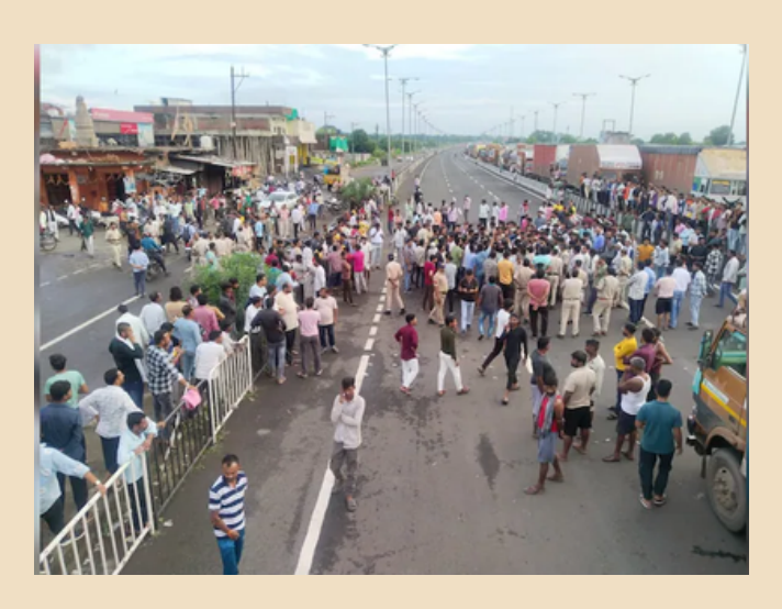
Link to the article: (September 7th, 2024) <a href="https://mpcg.ndtv.in/madhya-pradesh-news/double-murder-in-raghogarh-bodies-of-father-and-son-found-in-field-quna-police-6513125">https://mpcg.ndtv.in/madhya-pradesh-news/double-murder-in-raghogarh-bodies-of-father-and-son-found-in-field-quna-police-6513125</a>

There was an uproar after the bodies of a man and his son were found in a maize field near ITI college under Raghogarh police station in Guna district, Madhya Pradesh. The pair had left to graze their goats as usual, but did not return home that night. On the next day, family members went looking for the 80 year old father and his 30 year old son. Upon hearing the news, people furiously blocked the national highway and the family protested on the main road of the city, shouting slogans and blocking the pathways. The family demanded to know the murderer, and accused the police of having a lax attitude, making people angrier. Police have said that the case is under investigation.