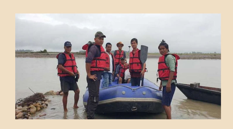
Link to the article: (September 5th, 2024) <a href="https://www.thehindu.com/news/national/arunachal-pradesh/arunachal-groups-protest-nhpcs-mega-dam-site-survey/article68590013.ece">https://www.thehindu.com/news/national/arunachal-pradesh/arunachal-groups-protest-nhpcs-mega-dam-site-survey/article68590013.ece</a>

On Wednesday, the Siang Ecosystem Environment Animal Nurturing Group visited flood damage sites in Sigar, Ralling, Borguli, Seram, and Namsing villages down the Siang River to assess the damage in at-risk areas. The river's left bank covers the agricultural fields of Ralling and Motums, where overflowing has eroded numerous hectares of land. The team also observed flood damage at Borguli, Seram, and Namsing, where the flooding Siang River has eroded fields, roads, and electric lines.