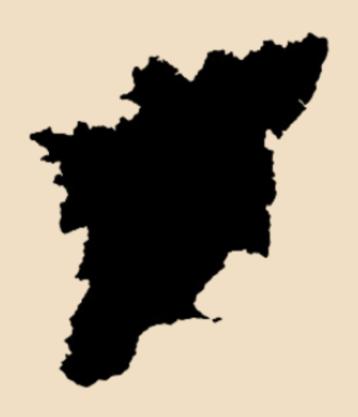
Link to the article: (September 8th 2024) <a href="https://www.thehindu.com/news/cities/Tiruchirapalli/s">https://www.thehindu.com/news/cities/Tiruchirapalli/s</a> <a href="mailto:eptember-13-is-last-date-to-apply-for-tns-green-entrepreneurship-scheme/article68618852.ece">https://www.thehindu.com/news/cities/Tiruchirapalli/s</a> <a href="mailto:eptember 8th 2024">eptember 8th 2024</a>) <a href="mailto:eptember 8th 2024</a>)

The Tamil Nadu State Rural Livelihoods Mission (TNSRLM) has introduced a scheme to empower entrepreneurs and their eco-friendly rural businesses, named the "Green Entrepreneurship Scheme." There are multiple requirements for eligibility, including the business being ecofriendly, having MSME or Aadhar recognition, and having an annual income of 4 lakh rupees. The scheme offers 4 lakhs in loan assistance given in three installments, with additional incentives. The deadline for application for the Scheme is September 13. District Collector P. Akash has encouraged entrepreneurs to apply promptly.