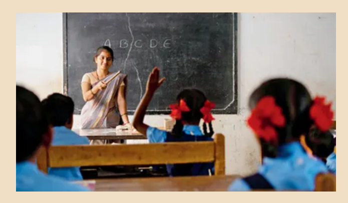
Link to the article: (September 6th, 2024) <a href="https://www.mid-day.com/amp/mumbai/mumbai-news/article/retired-educators-to-tackle-teacher-shortages-in-maharashtras-rural-schools-23388277">https://www.mid-day.com/amp/mumbai/mumbai-news/article/retired-educators-to-tackle-teacher-shortages-in-maharashtras-rural-schools-23388277</a>

The identification of the problem has led to a major policy shift aimed at addressing the teacher shortage in schools with low student enrollment, which has been introduced by the Maharashtra School Education and Sports Department. The government seeks to harness the experience of retired teachers while also tackling the state's surplus of unemployed teaching graduates. However, the decision has faced criticism from teachers' unions and educational activists, who argue it may limit opportunities for young educators.