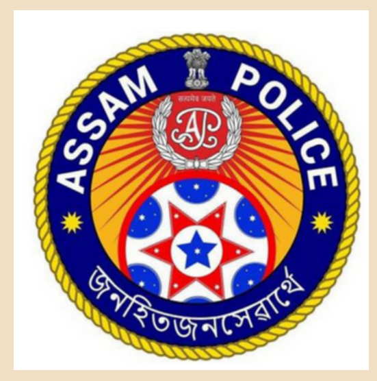
Link to the article: (September 3, 2024) <a href="https://boroktimes.com/assam-to-designate-poba-reserve-forest-as-wildlife-sanctuary/">https://boroktimes.com/assam-to-designate-poba-reserve-forest-as-wildlife-sanctuary/</a>

The families of these persons have not been given any additional information.