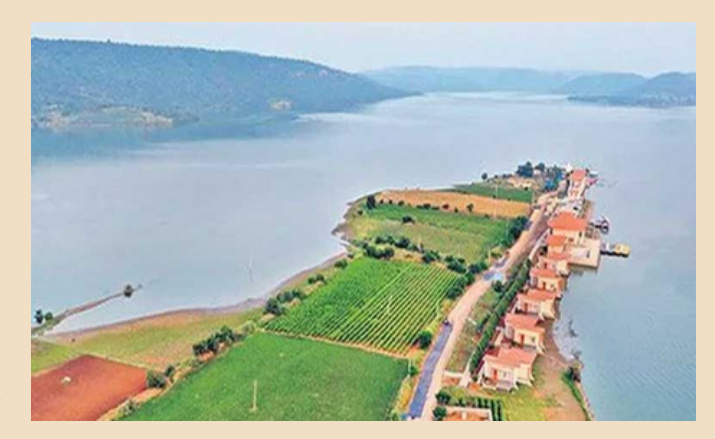
Link to the article: (September 27th, 2024) <a href="https://munsifdaily.com/nirmal-and-somasila-villages-in-telangana-honored-as-indias-top-tourism-destinations-for-2024/">https://munsifdaily.com/nirmal-and-somasila-villages-in-telangana-honored-as-indias-top-tourism-destinations-for-2024/</a>

Nirmal village, renowned for its cultural heritage in crafts, particularly "Nirmal paintings" and wooden toys, has been recognized in the "Crafts" category by the Ministry of Tourism. Located 220 kilometers from Hyderabad, Nirmal boasts an artistic tradition dating back to the Mughal era. Additionally, Somasila village in Nagarkurnool district received an award in the "Spiritual – Wellness" category for its picturesque landscapes and the revered Somasila Temple. These accolades are part of the Ministry's "Best Tourism Villages 2024" initiative, which saw 991 applications from across India, ultimately recognizing 36 villages in eight categories to promote rural tourism.