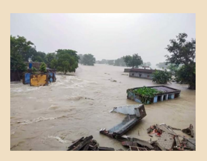
Link to the article: (September 30th, 2024) <a href="https://bilkulonline.com/2024/09/30/devastating-floods-turn-villages-into-islands-in-north-bihar/">https://bilkulonline.com/2024/09/30/devastating-floods-turn-villages-into-islands-in-north-bihar/</a>

Widespread flooding caused by excessive rainfall in Nepal's catchment areas has submerged multiple villages in North Bihar, particularly in West Champaran district. Villages like Madhopur and Guanaha are now isolated, leaving residents without access to food or transportation. With embankments breaching in several districts, farmers have lost their crops, and the need for government aid, including food and boats, is growing urgent. The devastation has left communities in dire straits, and urgent action is needed to restore normalcy.