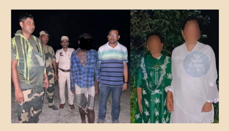
Link to the article: (September 24th, 2024) https://assamtribune.com/assam/assam-police-foil-2infiltration-bids-in-two-days-pushes-back-7bangladesh-nationals-1552453? utm source=internal-artice&utm medium=also-read

With this most recent occurrence, 72 Bangladeshi nationals have been detained while trying to enter Assam since the country's political unrest began, the majority of which were found in Karimganj district, followed by Bongaigaon, Dhubri, and Haflong GRP. The state administration has instructed the police to gather documents including Aadhaar, PAN cards, voter IDs, and passports of suspected foreign nationals in Assam due to growing reports of such individuals.