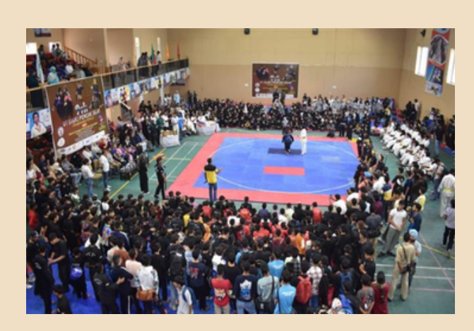
Link to the article: (September 23rd, 2024) <a href="https://risingkashmir.com/pencak-silat-fuels-confidence-and-discipline-among-rural-jk-girls/#:~:text=For%20rural%20children%2C%20especially%20girls,physical%20and%20mental%20well%20being.">https://risingkashmir.com/pencak-silat-fuels-confidence-and-discipline-among-rural-jk-girls/#:~:text=For%20rural%20children%2C%20especially%20girls,physical%20and%20mental%20well%20being.</a>

Pencak Silat, a traditional Indonesian martial art, is gaining popularity in rural Jammu & Kashmir, particularly among girls. This sport is empowering young women, offering them confidence, self-defense skills, and improved physical and mental well-being. In regions where girls' participation in physical activities has been limited due to social and economic challenges, Pencak Silat is breaking barriers. With support from Khelo India centers, the Pencak Silat Sports Association, and the J&K Sports Council, rural girls are excelling in national and international tournaments, inspiring others and promoting gender equality in sports across the region