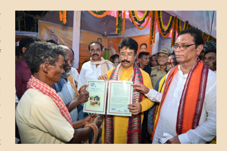
Link to the article: (September 24th, 2024) <a href="https://www.downtoearth.org.in/forests/fra-implementation-mankidia-community-becomes-6th-pvtg-to-get-habitat-rights-over-forests-in-odisha">https://www.downtoearth.org.in/forests/fra-implementation-mankidia-community-becomes-6th-pvtg-to-get-habitat-rights-over-forests-in-odisha</a>

The Mankidia community in Odisha has officially received habitat rights over local forests, becoming the sixth Particularly Vulnerable Tribal Group (PVTG) to do so under the Forest Rights Act of 2006. This recognition, granted on September 22, enables the Mankidia to legally access and utilize forest resources essential for their traditional livelihoods and cultural practices. The ceremony was attended by state ministers, highlighting Odisha's leadership in granting habitat rights to PVTGs. Previously, the Mankidia faced restrictions on forest use despite their historical dependence on these lands for survival and rituals.