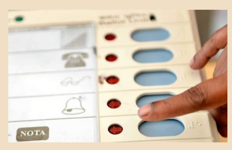
Link to the article: (September 26th, 2024) <a href="https://www.newindianexpress.com/nation/2024/Sep/26/panchayat-polls-in-punjab-to-be-held-on-oct-15">https://www.newindianexpress.com/nation/2024/Sep/26/panchayat-polls-in-punjab-to-be-held-on-oct-15</a>

Punjab will hold elections for 13,327 panchayats on October 15, as announced by State Election Commissioner Raj Kamal Chaudhary. Nominations can be submitted from September 27 to October 4, with scrutiny on October 5 and withdrawal of nominations by October 7. There will be 19,110 polling booths, with expenditure limits set at Rs 40,000 for sarpanches and Rs 30,000 for panches. The total number of voters is 1,33,97,932, and the elections will utilize ballot boxes, with a NOTA option available. Vote counting will occur on the same day. Approximately 96,000 personnel will oversee the elections, supported by 23 IAS/PCS officers as observers.