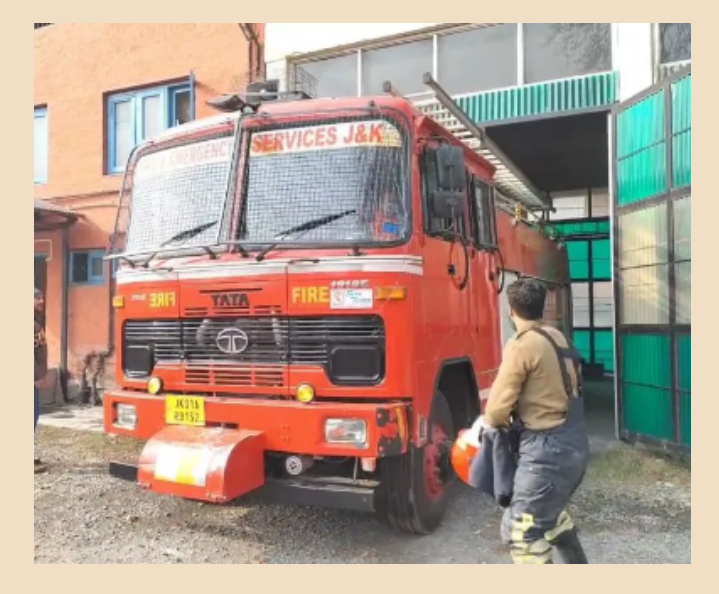
Link to the article: (16th October, 2024) https://www.greaterkashmir.com/kashmir/fireemergency-services-deptt-fails-to-set-up-requisitefire-service-stations/

The Rural Development Department and Panchayati Raj, Jammu & Kashmir, has dismissed claims circulating on social media about new gualifications for Sarpanch candidates in the Union Territory. A viral post falsely stated that the J&K government issued a notification under the "J&K Panchayati Raj Act, 1989" introducing new eligibility criteria, including a minimum age of 25 and a 12th-grade education. The department has warned users against spreading such misinformation and emphasised that no changes have been made to the existing local governance structures or election processes. The RDD urges caution in sharing unverified news related to governance.