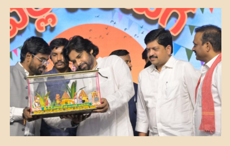
Link to the article: (14th October, 2024): https://www.thehindu.com/news/national/andhrapradesh/deputy-chief-minister-pawan-kalyanlaunches-palle-panduga-in-krishna-district-ofandhra-pradesh/article68751872.ece

Deputy Chief Minister K. Pawan Kalyan inaugurated 30,000 development projects across 13,326 villages in Krishna district on October 14 as part of the Palle Panduga initiative, with an estimated cost of ₹4,500 crore. This effort follows record-breaking village meetings held on August 23, 2024. The projects, primarily focused on roads and water conservation, will be executed under the Mahatma Gandhi National Rural Employment Guarantee Scheme (MGNREGS). In Kankipadu, specific projects include 11 cement roads and a compound wall for the Community Health Center. Notable attendees included Minister Kollu Ravindra and various local MLAs.