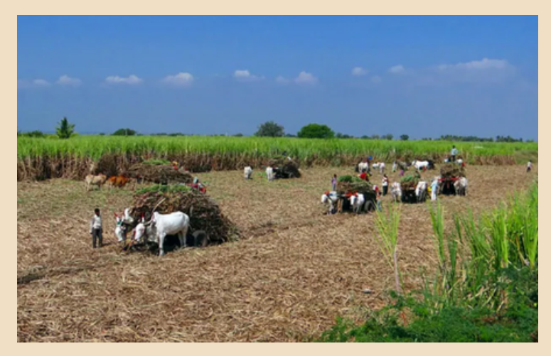
Link to the article: (19th October 2024) https://www.ndtv.com/india-news/explainer-howglobal-tensions-are-affecting-farmers-in-madhyapradesh-6827211

Earlier, there have been several reports of farmers of Madhya Pradesh struggling because of lack of a fertilizer. di-ammonium phosphate. vital Approximately 90% of India's supply of the fertilizer comes from international sources which have been interrupted by recent conflicts, forcing vessels to take longer routes and often increasing transportation and insurance costs. Madhya Pradesh, which is one of India's leading states in terms of agricultural produce, requires around 7 lakh metric tonnes of di-ammonium phosphate for the rabi season.