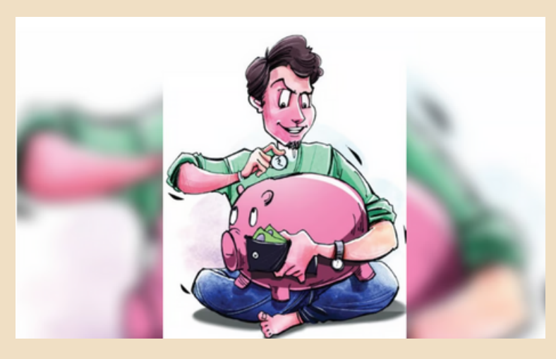
Link to the article: (20th October, 2024) https://www.newindianexpress.com/states/odisha/20 24/Oct/20/despite-low-income-73-per-cent-of-ruralfamilies-in-odisha-save-money_

A recent survey revealed that 73% of rural families in Odisha manage to save money despite low income levels. The study, conducted by the Odisha State Rural Livelihoods Mission, highlights that these families prioritise savings for emergencies and future needs. Interestingly, many households save through informal means, such as self-help groups or local savings schemes. The findings suggest a strong financial discipline among rural populations, reflecting their resilience and adaptability in challenging economic conditions. This trend underscores the importance of promoting formal savings channels to enhance financial security further.