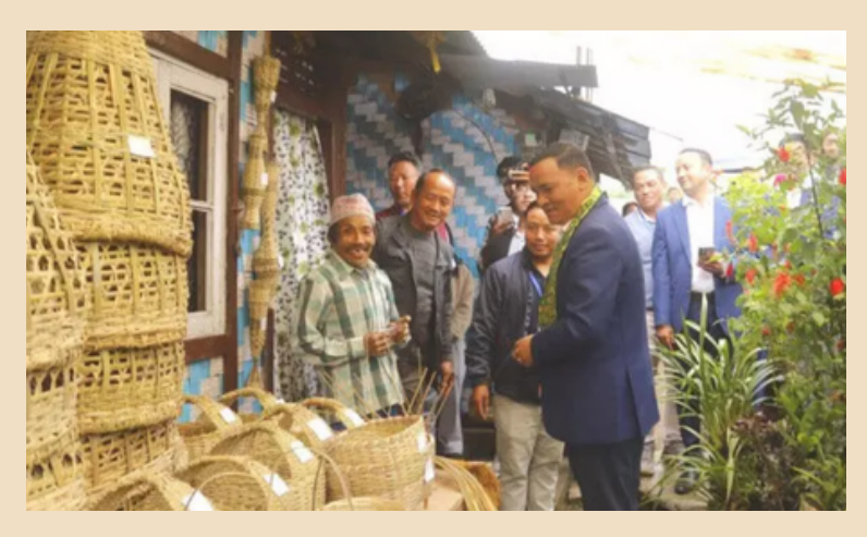
Link to the article: (17th October, 2024) https://jantaserishta.com/local/sikkim/sikkim-villagetourism-festival-started-in-darap-3591175? infinitescroll=1

The Sikkim Village Tourism Festival has commenced in Darap. The event aims to promote local culture, traditions, and tourism in the region. Various activities are planned, including cultural performances, handicraft exhibitions, and local cuisine showcases. The festival seeks to engage both locals and tourists, fostering a sense of community while highlighting the unique heritage of Sikkim. Officials hope this initiative will boost tourism and provide economic benefits to the local population. ( Translated from Hindi )