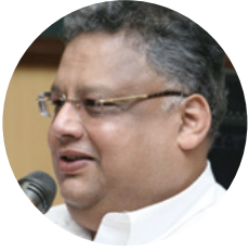
Rakesh Jhunjhunwala Founder - Rare Enterprises