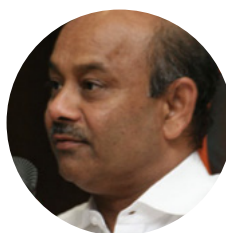
Radhakishan Damani Founder - Avenue Supermarts