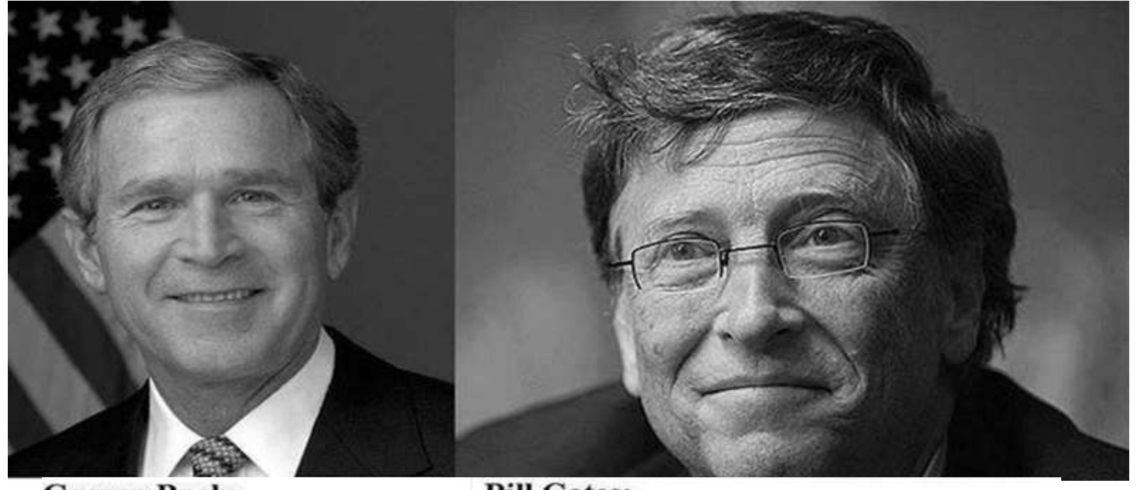
George Bush: People of US are unemployed!! Why u r employing foreign Engineers in Microsoft?